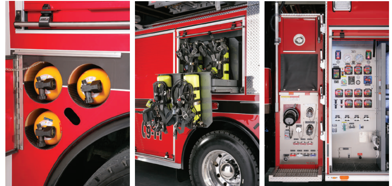
Available Configurations: MaxiSaber Pumpers, Pumper-Tankers, Tankers/Tenders, Rescue