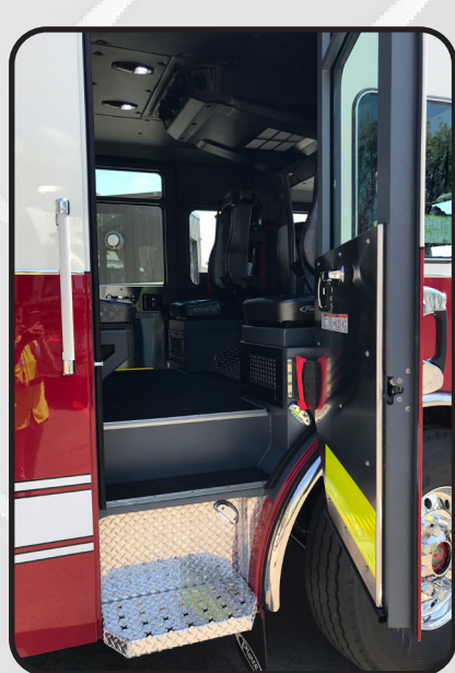
Please call for more information and pricing Stock No. 35547

Providing expert truck equipment solutions across Canada comemerg.ca 1-800-665-6126