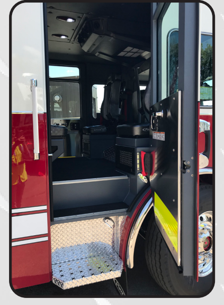
Please call for more information and pricing Stock No. 35483

Providing expert truck equipment solutions across Canada 1-800-665-6126 comemerg.ca