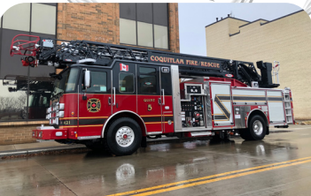
City of Coquitlam, BC Pierce Mfg. 107' Ascendant Ladder