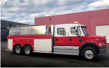
Mission, BC Maximetal Water Tanker