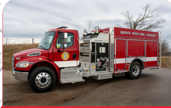
Quinte West, ON Pierce Mfg. FXP Pumper