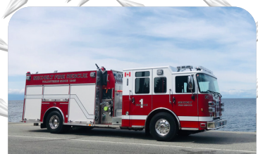
Sechelt, BC Pierce Mfg. & Maximetal Maxisaber Pumper