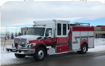
Brooks, AB Maximetal TME