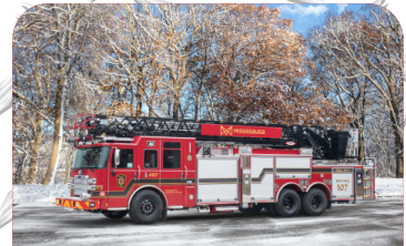
Mississauga, ON (3) Pierce Mfg. Enforcer 107' Ascendant