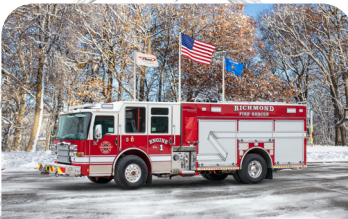
Richmond, BC Pierce Mfg. Dash CF Rescue Pumper