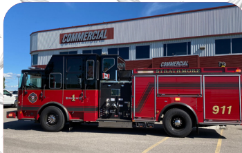
Strathmore, AB Pierce Mfg. Saber TME Pumper