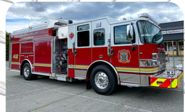
Powell River, BC Pierce Mfg. & Maximetal MaxiSaber Pumper