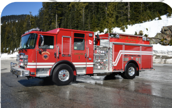
Dist. of W Vancouver, BC Pierce Mfg. Enforcer Pumper