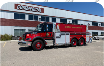
Rocky View County, AB Maximetal PIC