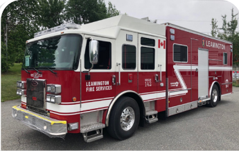
Leamington, ON Pierce Mfg. & Maximetal MaxiSaber Rescue