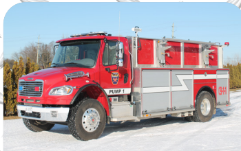
Prince Township, ON Maximetal PIC 2000 Tanker