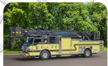
Airdrie, AB Pierce Mfg. Impel 110' Ascendant