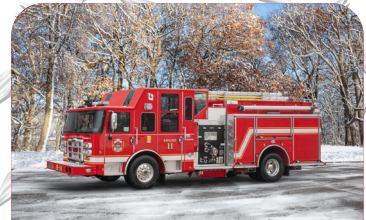
District of Taylor, BC Pierce Mfg. Enforcer TME Pumper