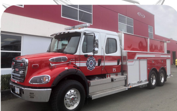
Abbotsford, BC Maximetal Water Tanker