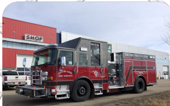
City of Leduc, AB Pierce Mfg. Enforcer TME Pumper