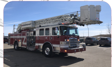
Drumheller, AB Pierce Mfg. Enforcer 110' Ascendant