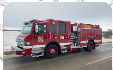
Winnipeg, MB Pierce Mfg. Impel Pumper