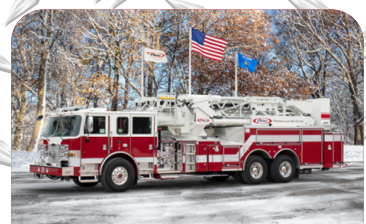
Lethbridge, AB Pierce Mfg. Arrow XT 100' Tower