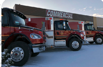
County of Grande Prairie, AB (3) Maximetal PIC Tanker