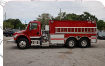
Sturgeon County, AB Pierce Mfg. Freightliner FXT Tanker