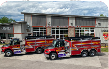
Six Nations, ON (2) Pierce Mfg. FXT Tanker