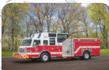
Wood Buffalo, AB (2) Pierce Mfg. Velocity TME Pumper