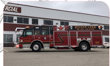
Sylvan Lake, AB Pierce Mfg. Velocity Pumper