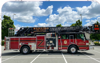
Nanaimo, BC Pierce Mfg. Velocity 110' Ascendant