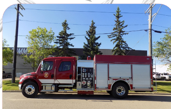
Enterprise, NT Pierce Mfg. FX Pumper