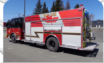
Township of Springwater, ON Maxisaber Pumper