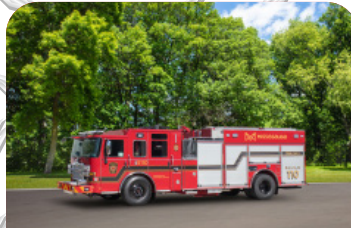
Mississauga, ON (2) Pierce Mfg. Enforcer Pumper