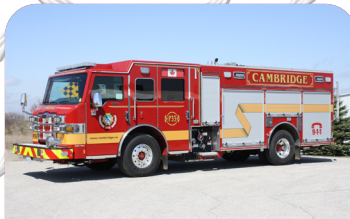
Cambridge, ON Pierce Mfg. Impel PUC Pumper