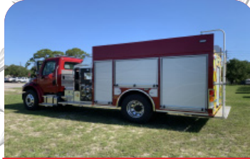
Tuktoyaktuk, NT Pierce Mfg. Freightliner FXP Pumper