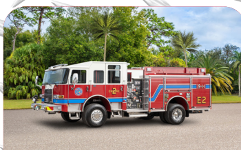
Northern Lights, AB Pierce Mfg. Saber 4x4 Pumper