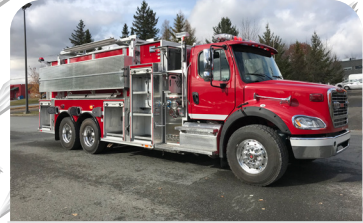
Cenovus Energy, AB Maximetal Freightliner Tanker