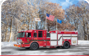
Mississauga, ON (2) Pierce Mfg. Enforcer Pumper