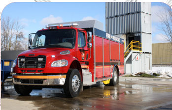
Ontario Power Generation Pierce Mfg. Encore Rescue