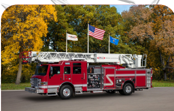
Milton, ON Pierce Mfg. 107' Ascendant