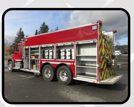
Please call for more information and pricing