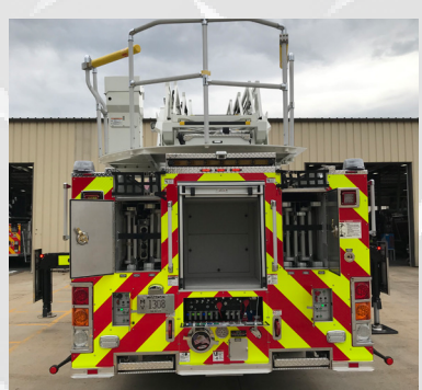
Please call for more information and pricing Stock No. 33391

Providing expert truck equipment solutions across Canada comemerg.ca 1-800-665-6126