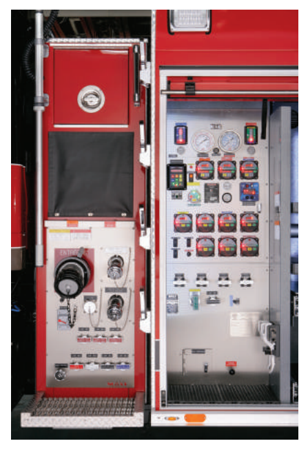
Available Configurations: MaxiSaber Pumpers, Pumper-Tankers, Tankers/Tenders, Rescue